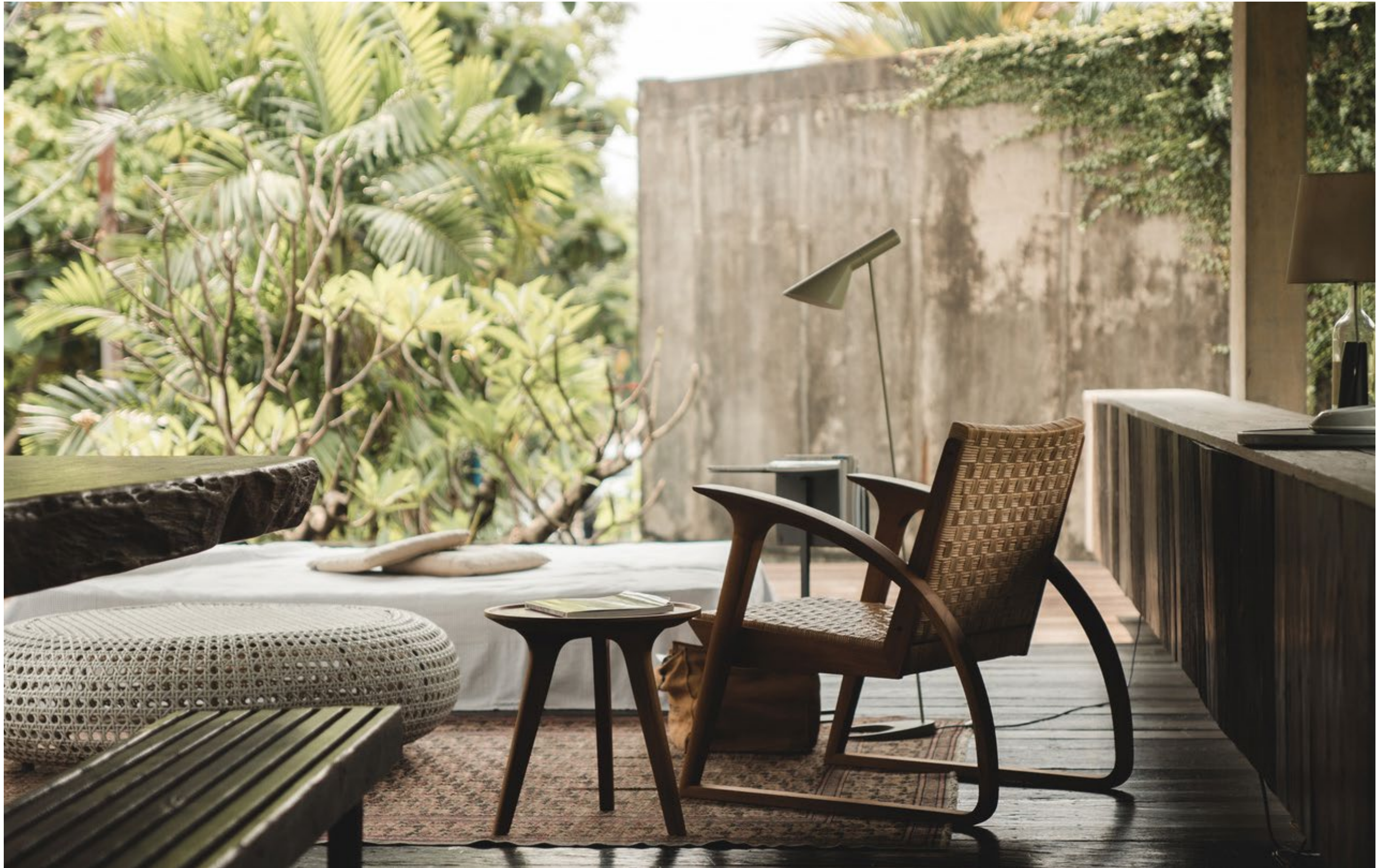
SEDAN relax chair and CILIK side table, in teak with teak oil finishing, at ANDRA MATIN house in bintaro, jakarta.