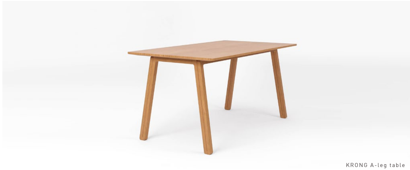
KRONG A-leg table