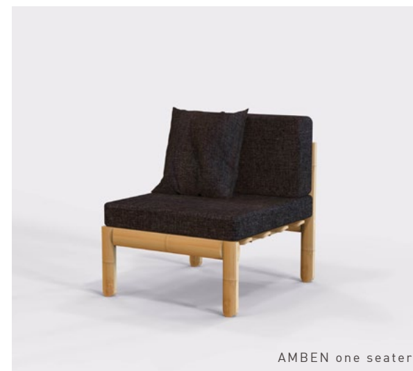
AMBEN one seater