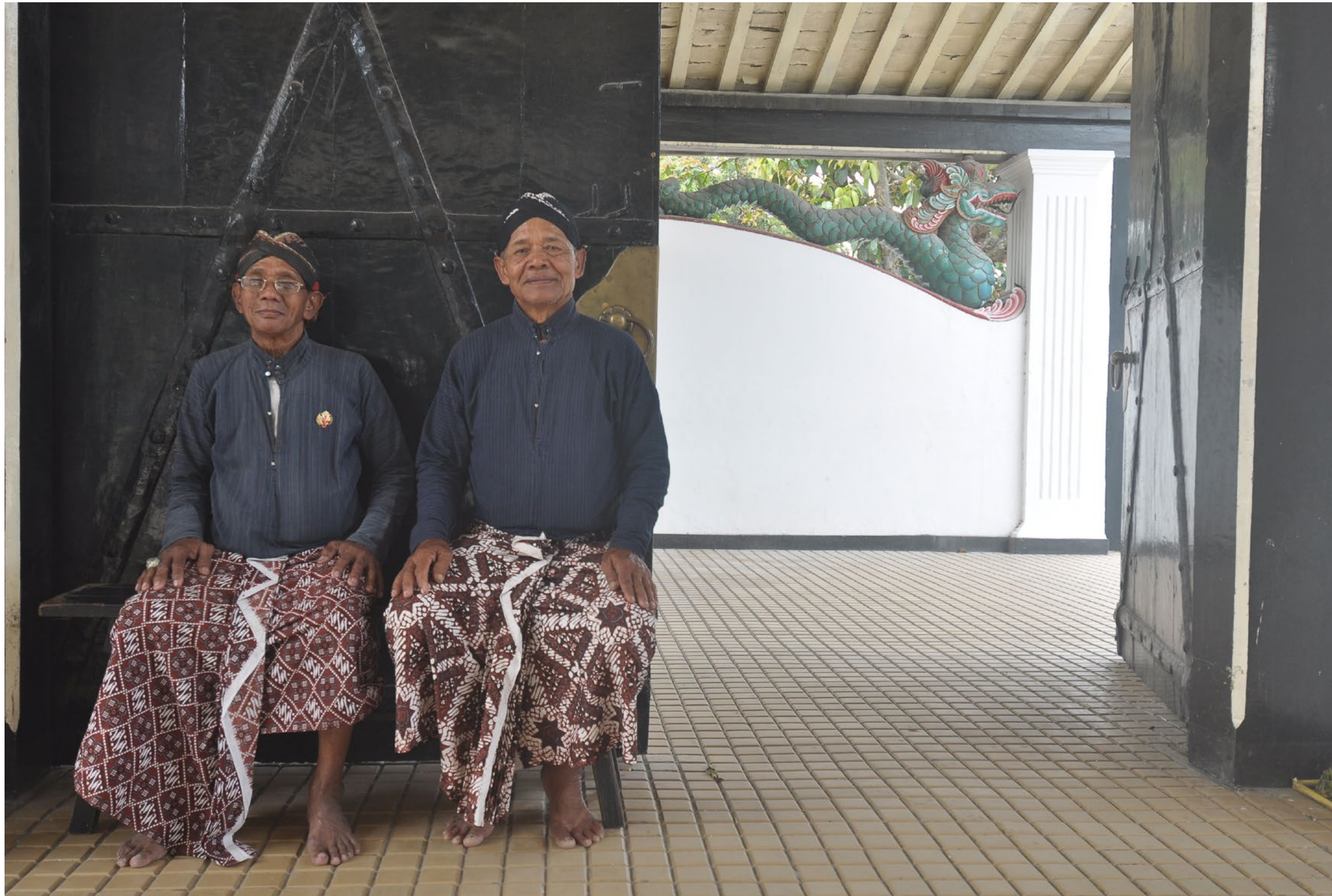
SANTAI roots in the heritage of java. we endeavour to revitalize elements of javanese culture through contemporary designs that reinterpret long-grown skills, style elements and local lifestyle.