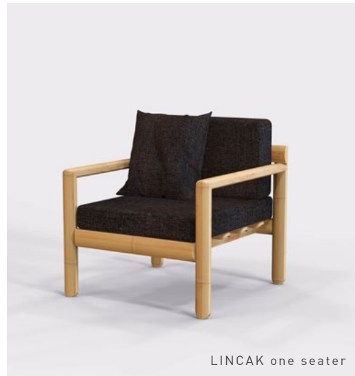
LINCAK one seater