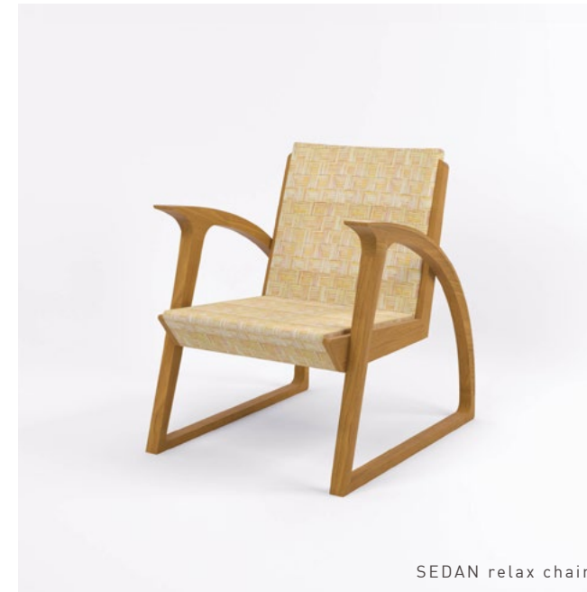
SEDAN relax chair

in the picture: JENGKI relax chair, teak, clear PU.