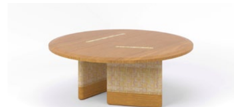
DEPROK coffee table

in the picture: DEPROK easy chair, mindi, clear PU.