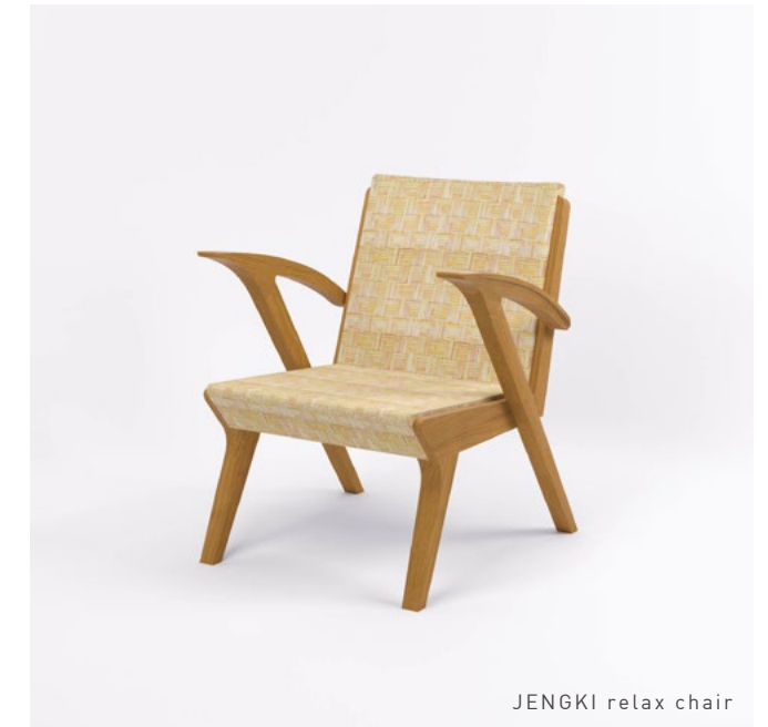
JENGKI relax chair