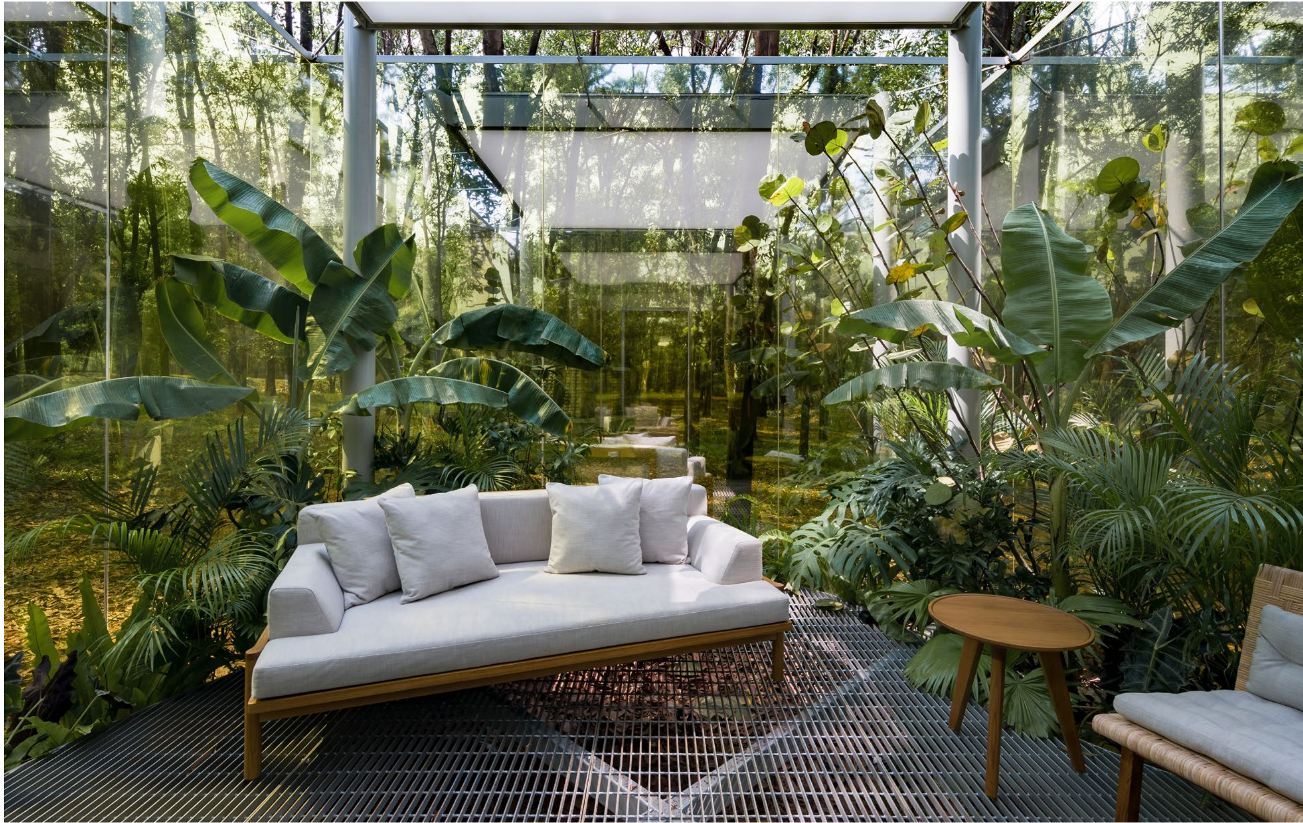
TUWUH daybed, designed by MUHAMMAD SAGITHA, using a 100% cotton fabric. "room" installation by TAMARA WIBOWO at bintaro design district 2023, jakarta.