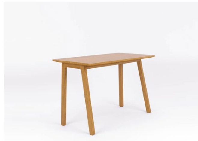
AGENG desk table