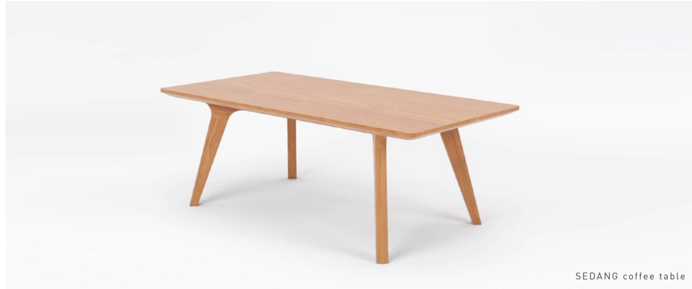
SEDANG coffee table