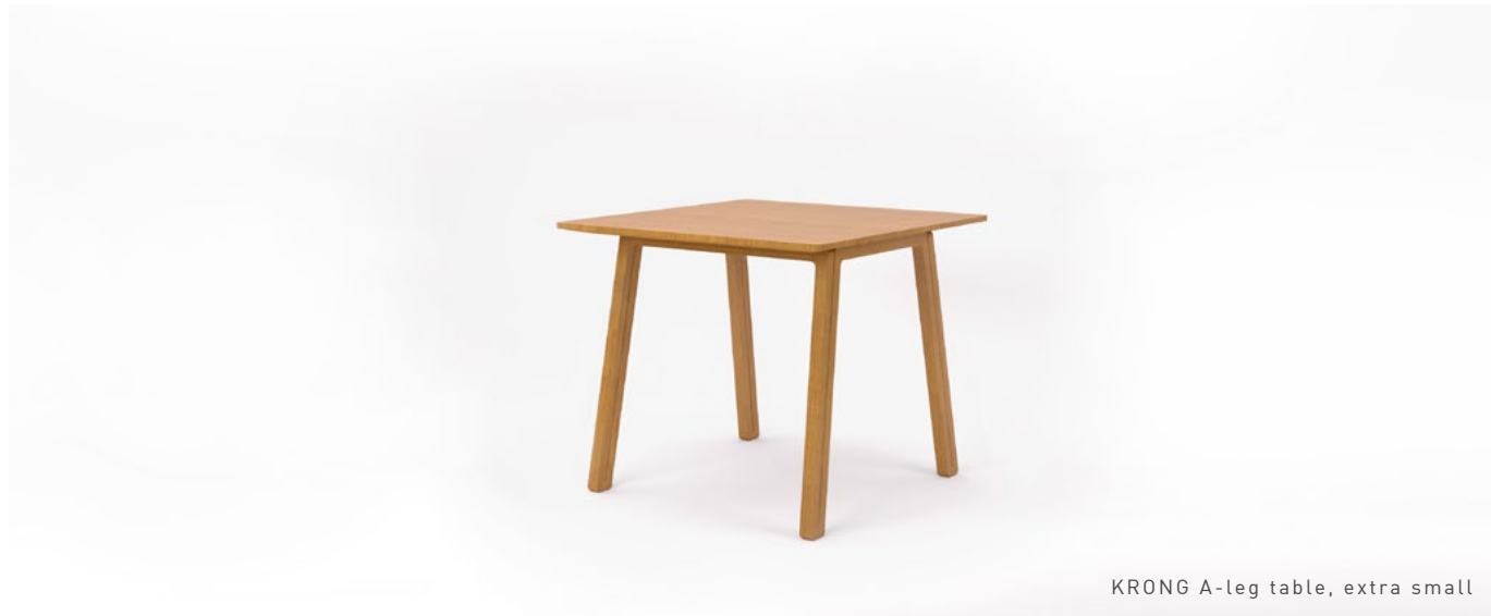
KRONG A-leg table, extra small