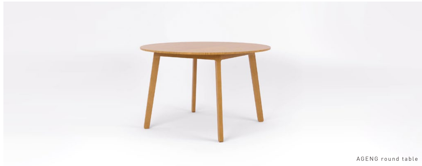
AGENG round table