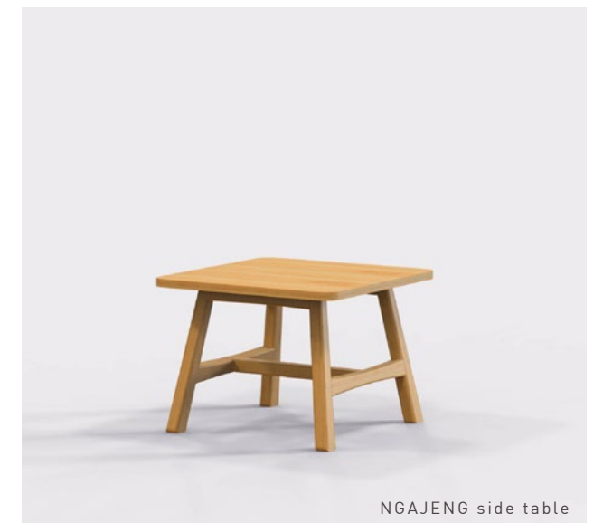
NGAJENG side table