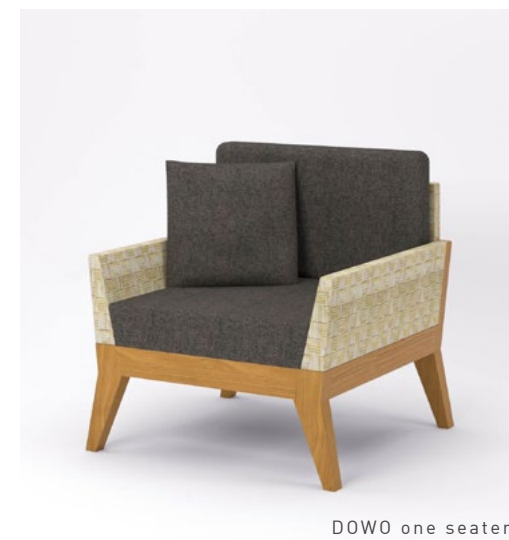
DOWO one seater