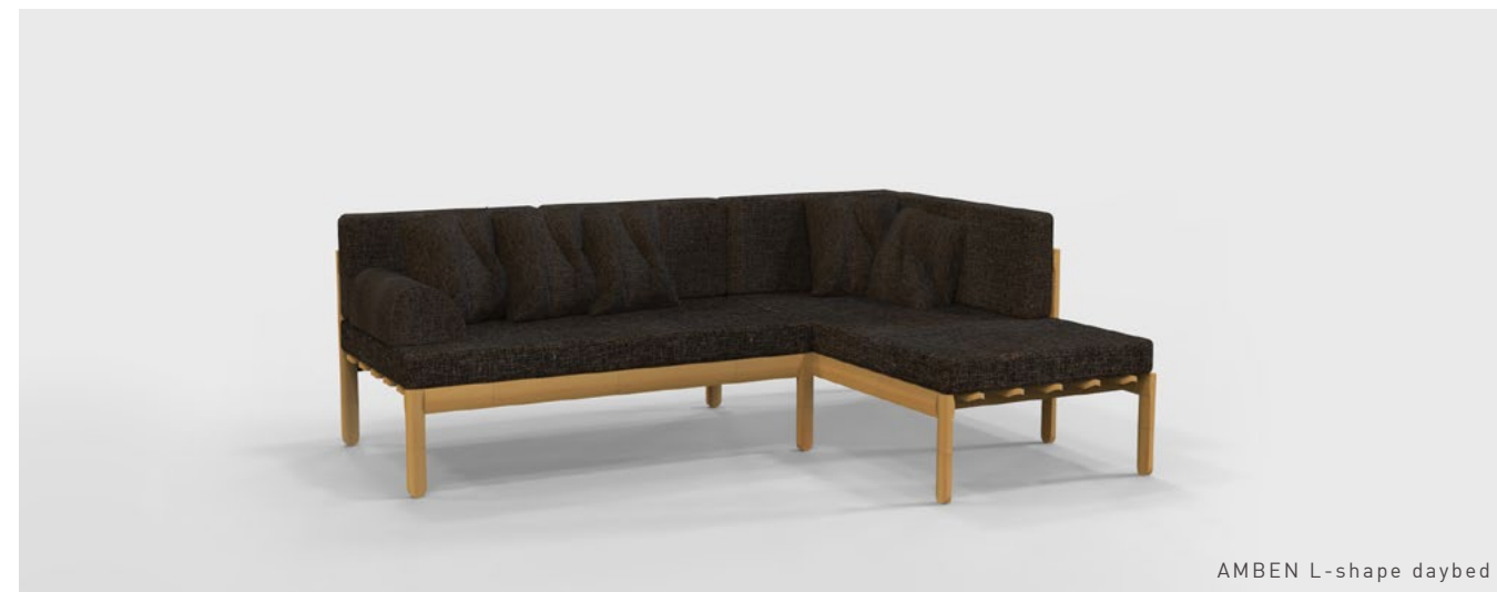
AMBEN L-shape daybed

in the picture: AMBEN daybed, bamboo, clear PU.