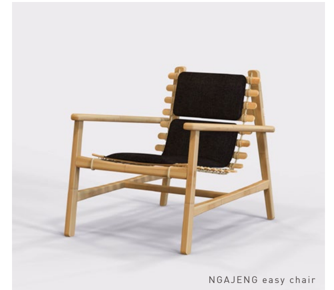
NGAJENG easy chair

in the picture: NGAJENG easy chair, bamboo, clear PU.