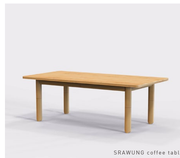
SRAWUNG coffee table