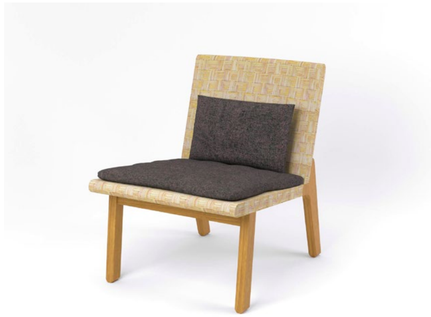
DEPROK easy chair