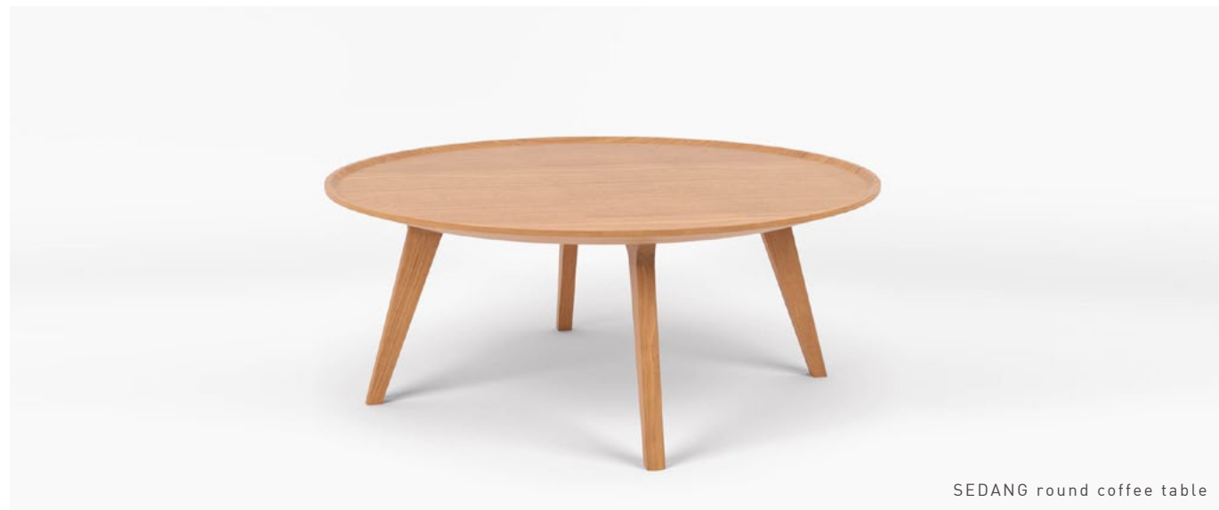
SEDANG round coffee table