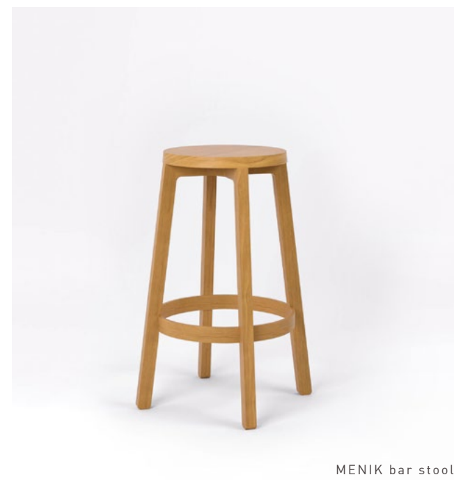
MENIK bar stool