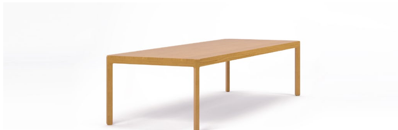
AGENG 3 meter table

AGENG table, in white oak with walnut stain finishing, at swietenia residence in singapore by GOY ARCHITECTS.