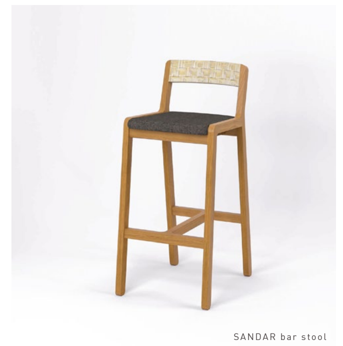
SANDAR bar stool