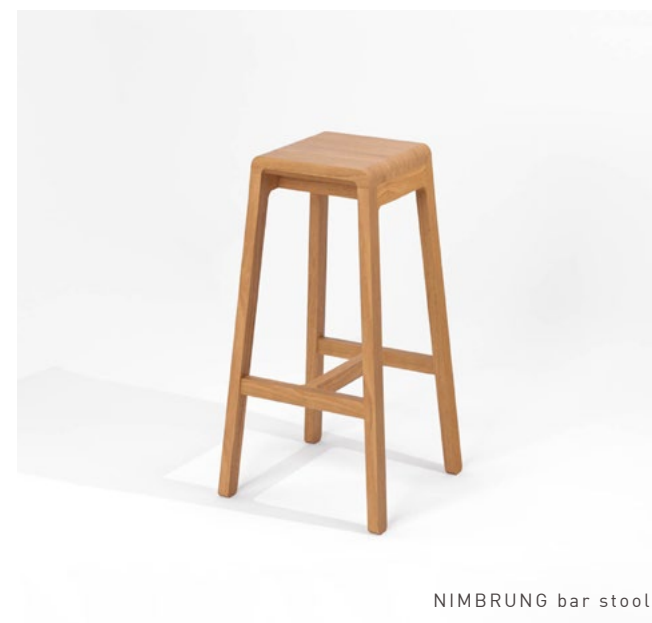
NIMBRUNG bar stool