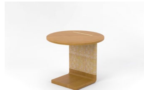
DEPROK side table