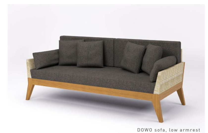
DOWO sofa, low armrest