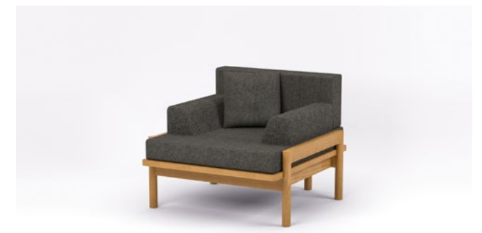
TUVUH one seater

in the picture: TUVUH daybed, white oak, clear PU.