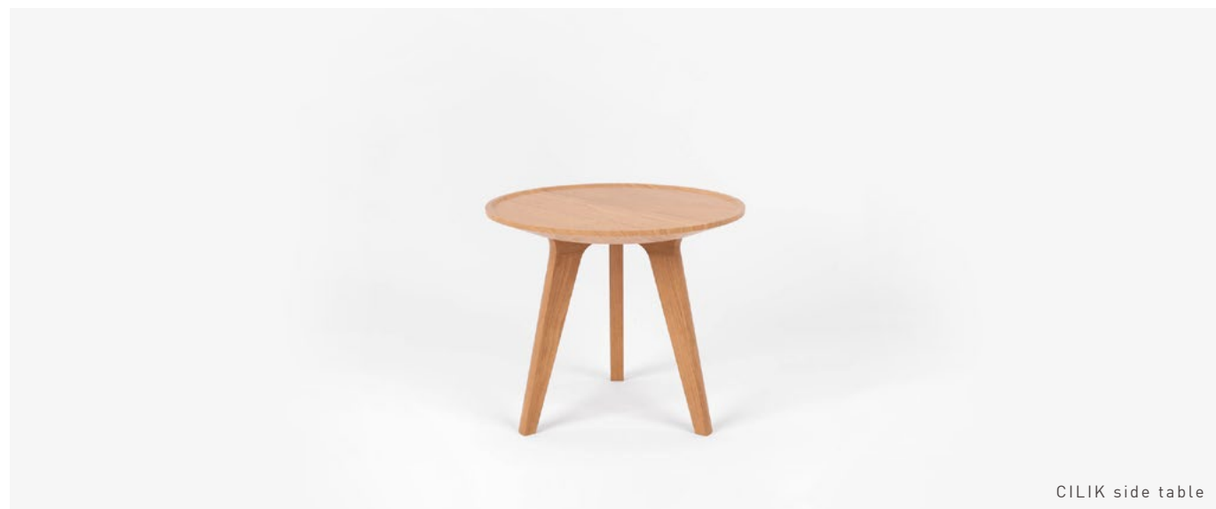
CILIK side table

in the picture: SEDANG coffee table, mindi, brown stain PU.